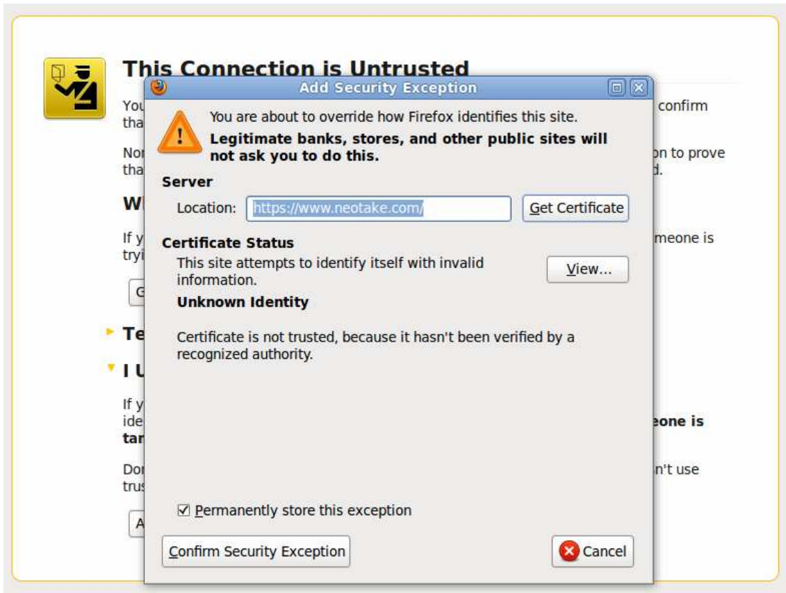
Fig 1.3: Firefox screenshot C.

Click on "Confirm your Security Exception" (keeping marked "Permanently store this exception").